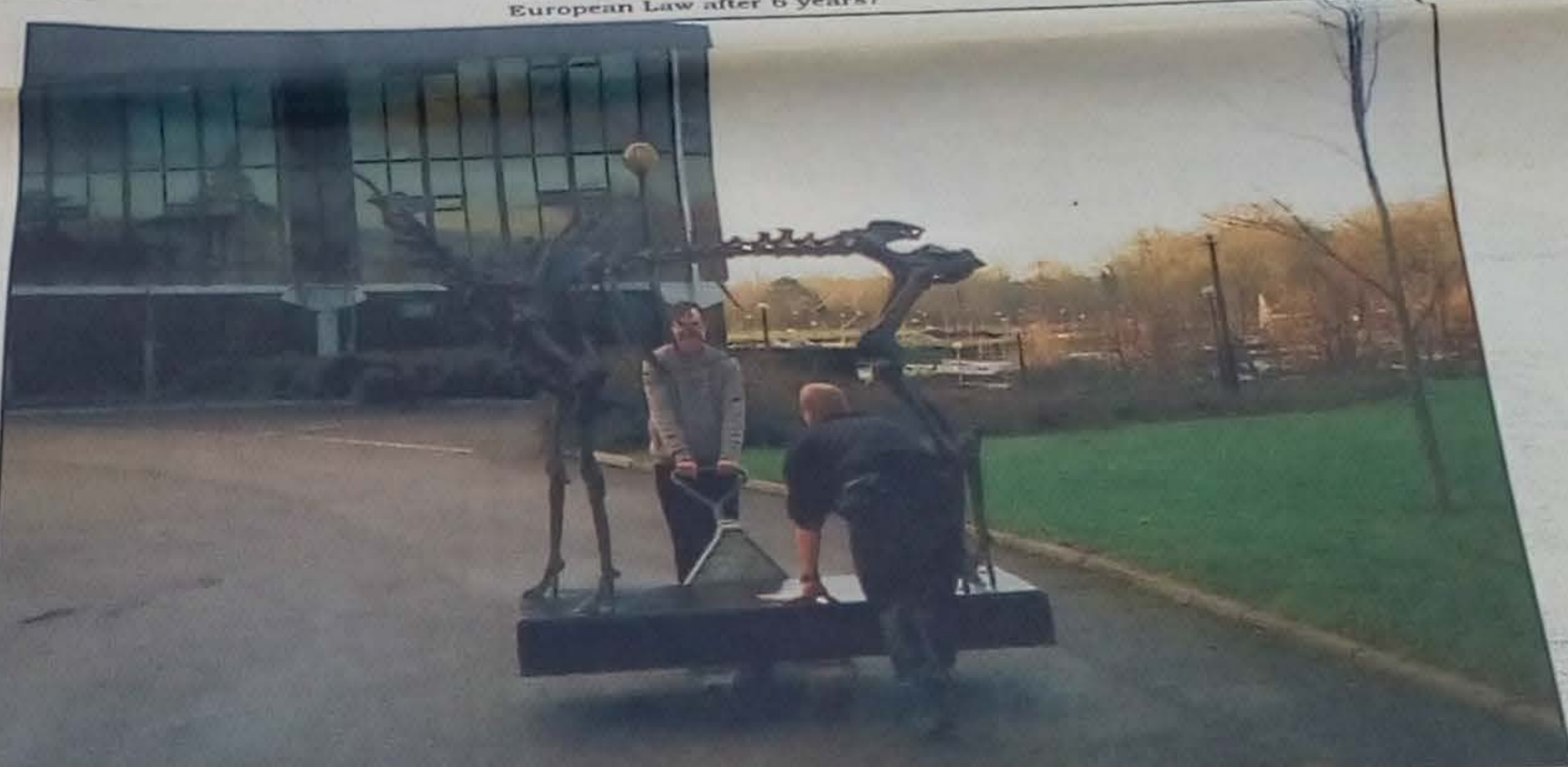
Skeleton removed from White House - Images of 25 Cromwell St. !

shout it? Given the obvious intransigence on the Society's part it would seem that the only avenue open is the legal one. To this end we have received a verbal commitment from the university that they would fund any challenge and it is now a matter of co-ordinating with the other unions around the country. If anyone has any queries call into the union and we will try to answer any concerns.